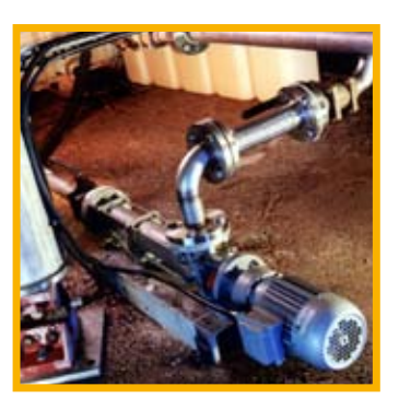
Transfer pump for water softening agents and sodium hydroxide liquor