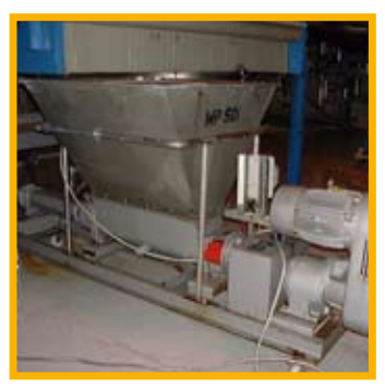
Widethroat pump transferring pharmaceutical filter cake