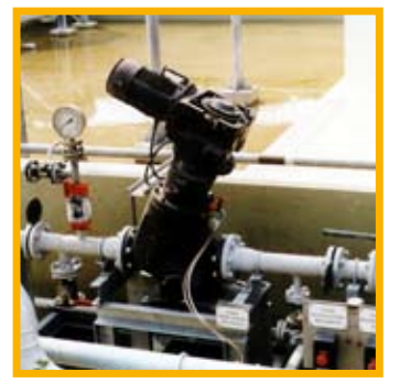
A Muncher macerating solids in secondary liquid fuel to prevent blocking pumps and filters